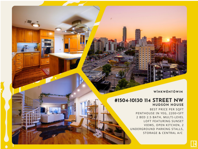
#1504 10130 114 STREET HUDSON HOUSE OLIVER, EDMONTON